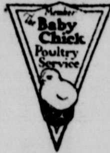
"The Sign of a Square Deal"

Listen to "Poultry Service Time" our own radio program over WLS, Chicago, every Saturday at 12 noon. Fun, music and entertainment.