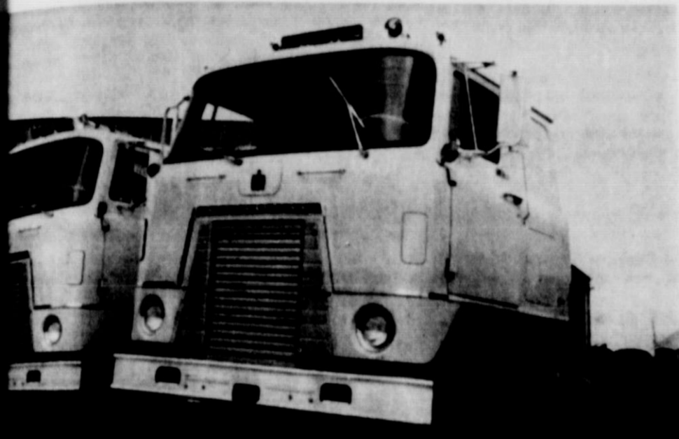
MOUTH OF THE HIGHWAY — Two giant International diesel trucks delivered to Thacker Co. at Roaring Springs recently from a factory in California. The trucks were purchased by Brasilton of Corpus Christi, and driven there June 4th. Each of the giants has ten tires, with pulling by means of tandem transmissions. The trucks were made to special order.

Matador, Motley County, Texas, Thursday, June 15, 1967