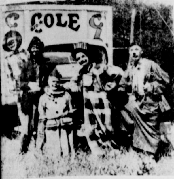
These pantomimists, jesters, joeys, merry men and clowns make merry throughout the performance of the Famous Cole Circus providing comedy relief for the aerial acrobatic thrills with the circus when seen in Matador, Texas, May 4th. The circus is sponsored by the Matley County...