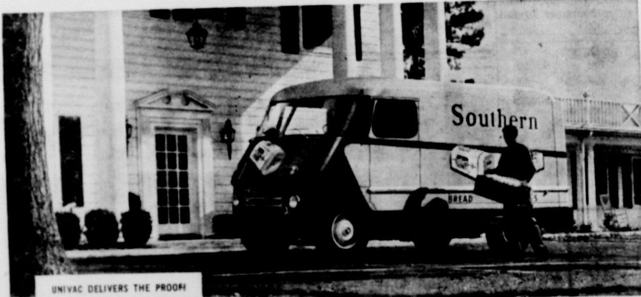
UNIVAC DELIVERS THE PROOF