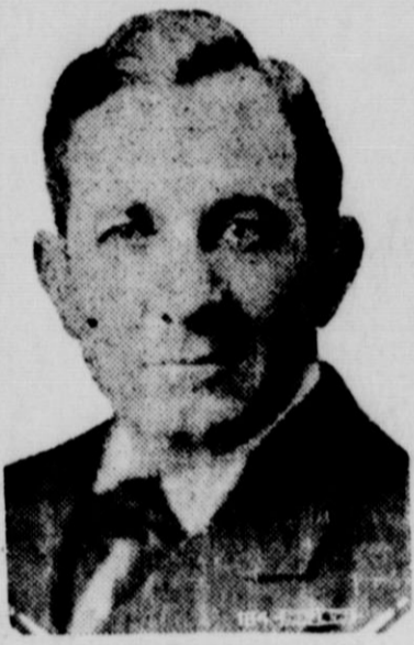
SEN. TOM CONNALLY