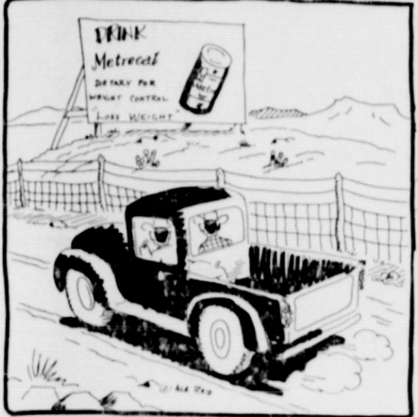
"We don't hafta worry about imported beef and lamb no more—seems like people are gonna quit eatin'."

This feature sponsored by THE FIRST STATE BANK