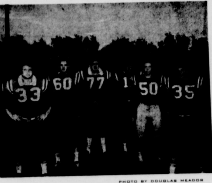
EXPERIENCE of these six senior lettermen will be the key to the Matadors' power Friday night when they open the 1967 season against Paducah Dragons at 8:30 p.m. on Burleson field.