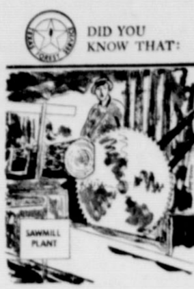
What is thought to be the first sawmill in Texas, horse powered, was built at San Augustine in 1825. Today there are 928 primary and secondary wood processing plants in the state, giving full time employment to 36,000 Texans. Value of goods produced, according to the Texas Forest Service, amounts to $500 million annually.