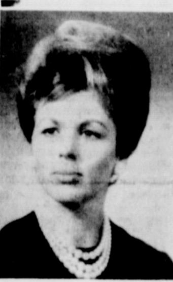
ETERNAS CLUB PRESIDENT