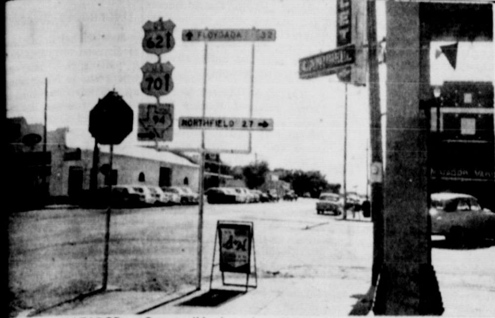
SIGNS IN MATADOR —Once mail-hack road to Childress by way of Northfield is now all the way. Intersection of the new road (Farm Road 94) is shown in the above photograph at the intersection of U. S. Highway 70 and Main Street. The picture, by Charlotte Campbell, is made from the Campbell Chevrolet corner, looking west. Left center of picture is Matador Auto Co. (Ford agency) and right center is Matador Variety (Masonic Building). The intersection is a four-way stop. The Northfield Road follows Main street to the north edge of the section, then turns right. The 27-mile road is among the most scenic in this area of the hill country.