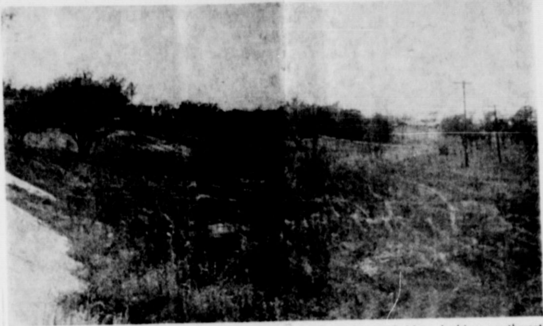
VIEW OF "THE CREEK" from a point at the North Main Street bridge, looking southwest. At the extreme left is the Tribune Building. More pictures of the work will be published later.