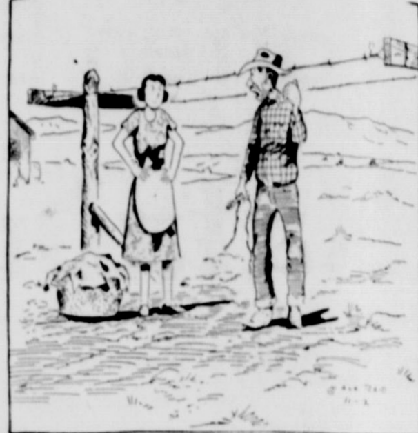
"But, maw, with this barbed wire you won't even need clothespins!"

This feature sponsored by THE FIRST STATE BANK