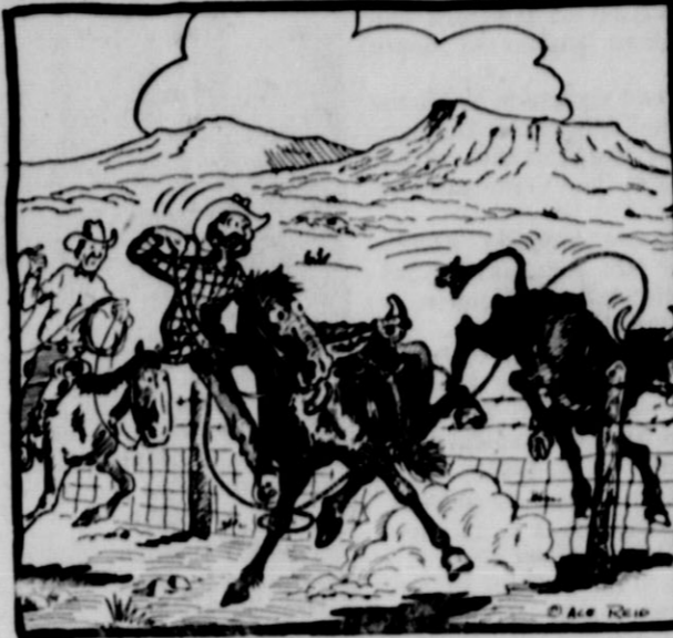
"Someday I'm gonna breed a type of cow that will know what gates are made for!"

This feature sponsored by THE FIRST STATE BANK MATADOR, TEXAS