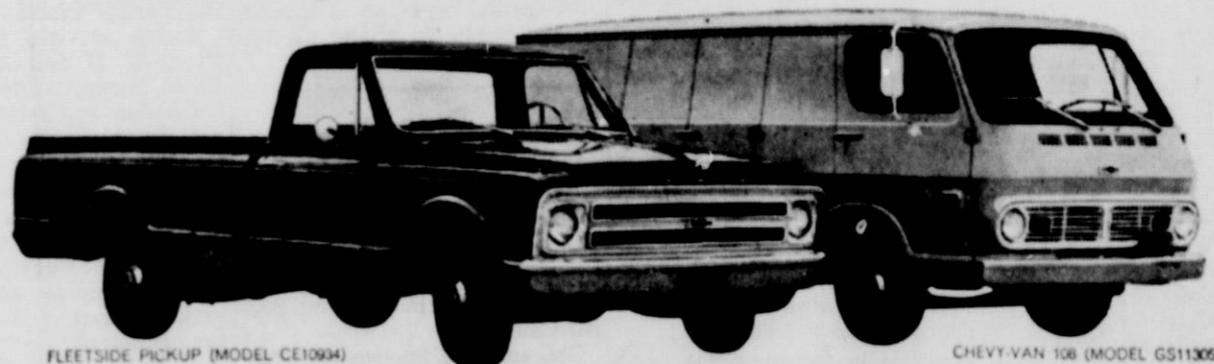
FLEETSIDE PICKUP (MODEL C610994)