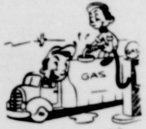
FILLER UP I'M GOING TO

To have national prosperity we must spend. But to have individual prosperity, we must save... which clears up everything.