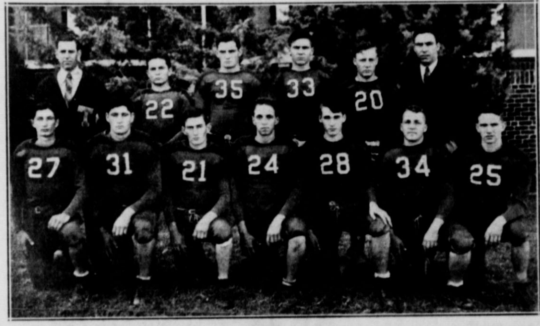
Local football fans place their hopes for championship honors this season on the shoulders of this team of 1940 Matador Matadors and their coaches.