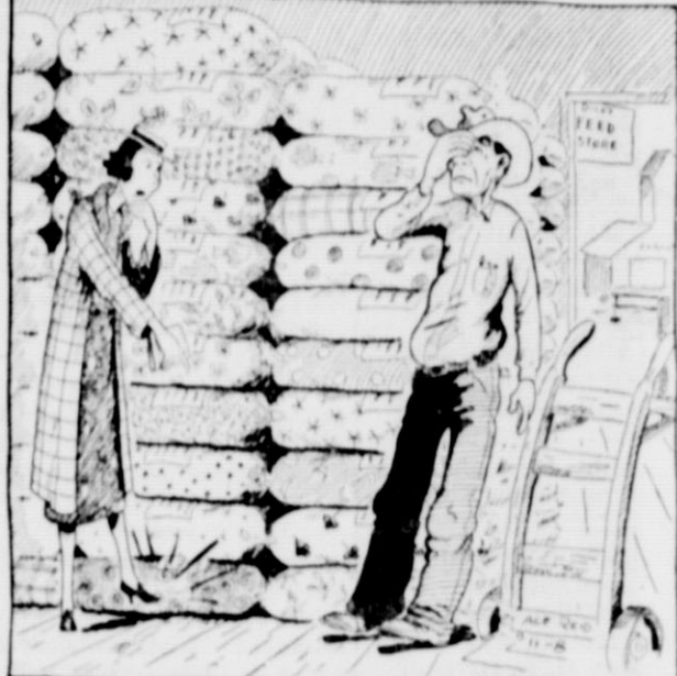
I'll take this one! It's such a nice print!

This feature sponsored by THE FIRST STATE BANK