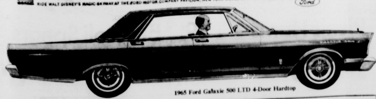
1965 Ford Galaxie 500 LTD 4-Door Hardtop

Save Now at Your Ford Dealer's Red, White and Blue Sale!