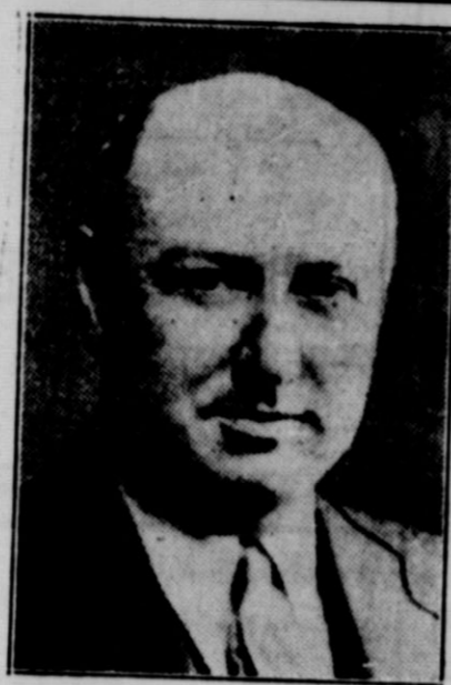
JAMES A. FARLEY Postmaster General