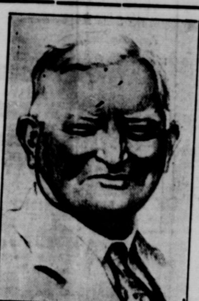
JOHN NANCE GARNER Vice President