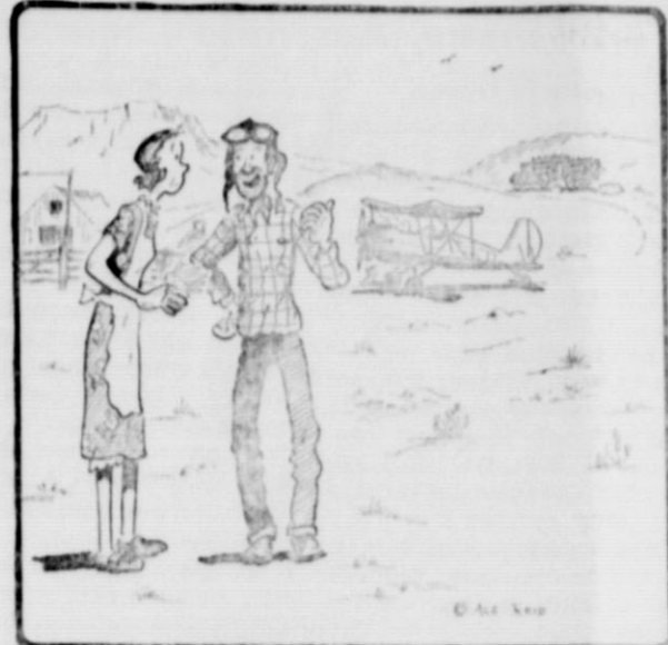
"Maw I just traded that ole dumb boy at the airport $800 worth of sorry calves for that nice airplane and a $1,000 worth of flyin' lessons!"

This feature sponsored by THE FIRST STATE BANK