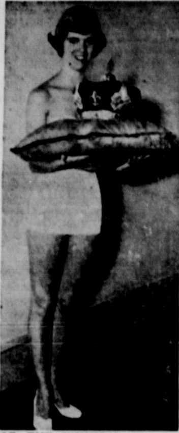
FOR THE WINNAHI —The energetic salesman who sells the most automatic gas water heaters in America from March 1—August 31, 1950 will be crowned "King of the Court of Flame" and will wear the jeweled crown held by the shapely Miss above. Coronation ceremonies will take place at the Gas Appliance Manufacturers Exhibition of gas appliances and equipment at Atlantic City, Oct. 6th. The presentation will high-light the current national sales campaign by GAMA, in which more than 100,000 dealers, plumbers and utility personnel, are taking part.