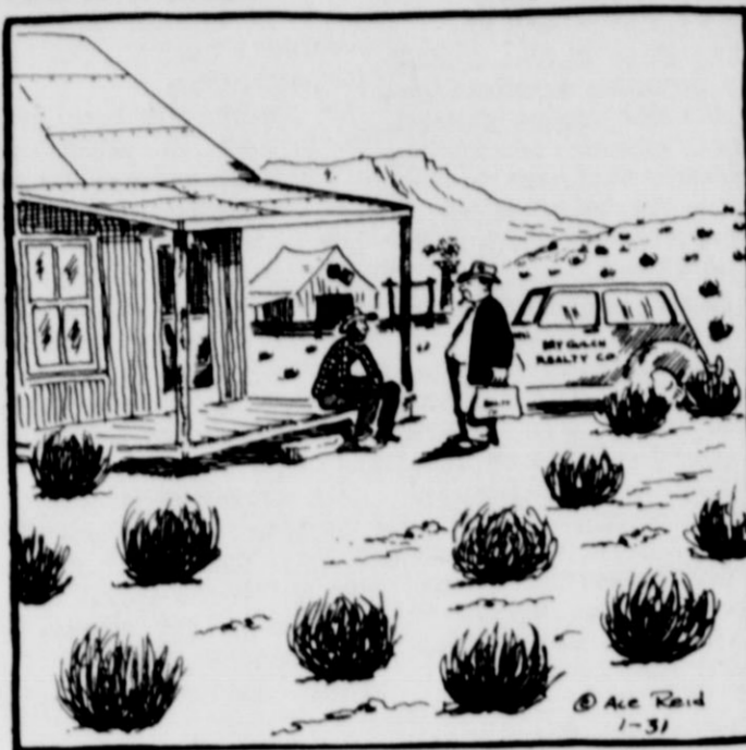
"Nope, ain't sellin'. The way the government subsidizes everything they jist might take us tumble weed growers next and I'd have it made!"

This feature sponsored by THE FIRST STATE BANK