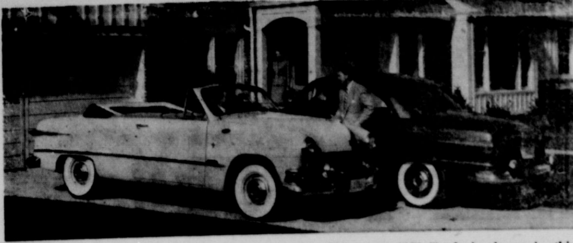
Distinctive new styling of both front and rear of the new 1951 Fords is shown in this photo of the Convertible and the Custom Club Coupe. The dual-spinner grille and longer, wrap-around bumpers give the front end a wider, more massive appearance and additional chrome and wider tail lights add to the rear end appearance. The 1951 models feature Fordomatic Drive, the new automatic transmission, as optional equipment.