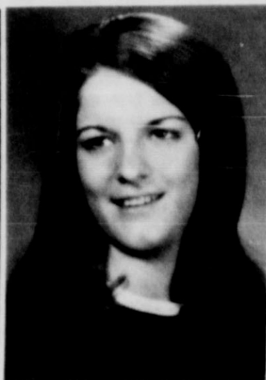
EL PROGRESSO CLUB GIRL OF THE YEAR