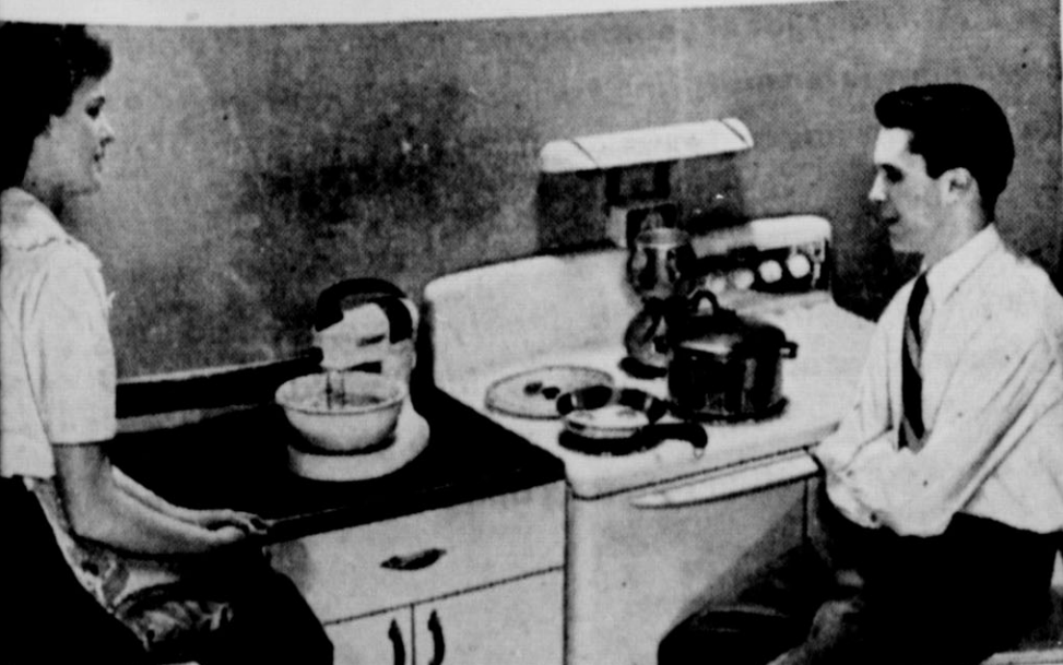
ecially when Reddy Kilowatt is doing it

a few pennies* a day! a bargain! And-the average family served by West Texas Utilities Company gets twice as much ric service for its money today as it did twenty