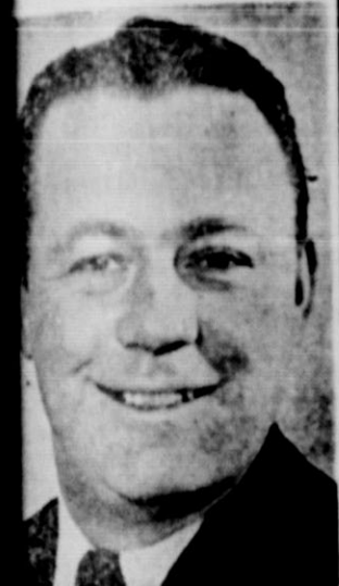
Let Him Tell You About The FLASH-O-TRAC SYSTEM