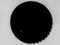
Large Fancoke Dial is easy to read, easy to set... gives positive heat control.

Made by the makers of the famous Hoover Cleaners. See it in our housewares department.