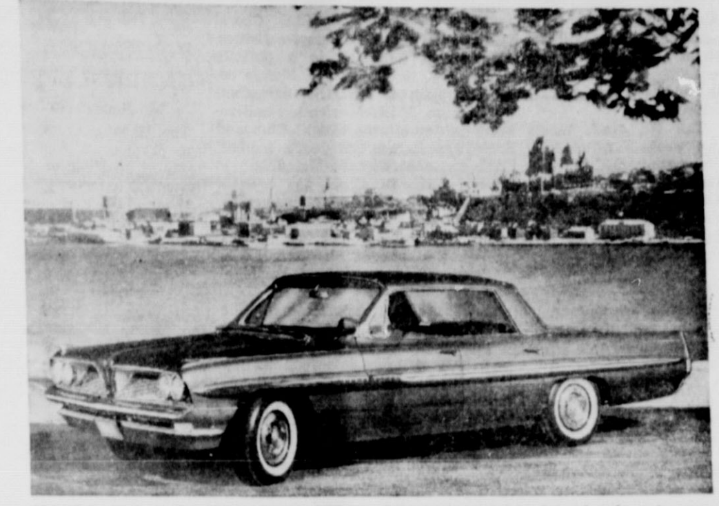
MOST POPULAR PONTIAC BODY STYLE , the rakish four-door Vista hardtop, is more beautiful than ever in the new 1961 Bonneville series. Curving windshield pillars, a slim line roof, and crisply defined side windows create a new custom appeal. Distinctive Bonneville features include the high performing Trophy V-8 engine with four barrel carburetor and luxurious upholstery of pattern cloths and Jewel-tone Morrokide. The exciting Vista also is available in the Star Chief, Ventura, and Catalina series.

A stage show was enjoyed by Patton Springs pupils Thursday afternoon at 2 o'clock, with skits, music and other entertainment.