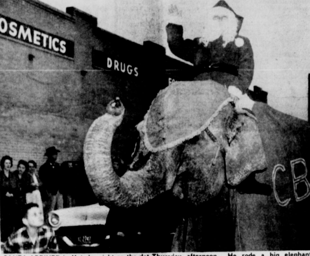
SANTA ARRIVED in Matador right on the dot Thursday afternoon. He rode a big elephant down Main Street at 4 p.m. and met hundreds of boys and girls personally. The colorful parade included the Matador Volunteer Fire Department truck, followed by the outstanding Patton Springs Rangers band and the Matador Drum and Bugle Corps. The pre-Christmas circus was sponsored by Matador merchants, firms and individuals. Santa will pay another visit to Matador on Dec. 24, Christmas Eve, sponsored by the Matador Lions Club.

The man who would not touch a gloved finger to a buzz saw, repeatedly places a booted foot on the accelerator.