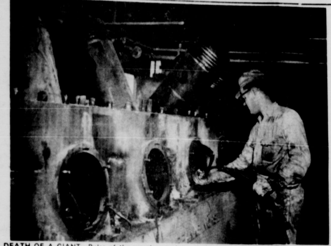
DEATH OF A GIANT —Pulse of the massive engine at the West Texas Utilities Company plant in Matador is silenced forever as workmen cut the 60,000-pound giant into pieces and hauled it away as scrap metal. The diesel was moved here from McCamey in 1931.

Wherever in this issue of the Tribune is a page advertisement listing many of the Matador's "2 for 1" sale specials, as well as many other items of merchandise at low prices made available for the birthday celebration.