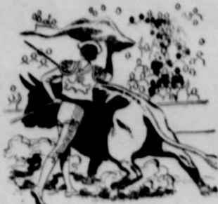
Official Publication Matador Schools