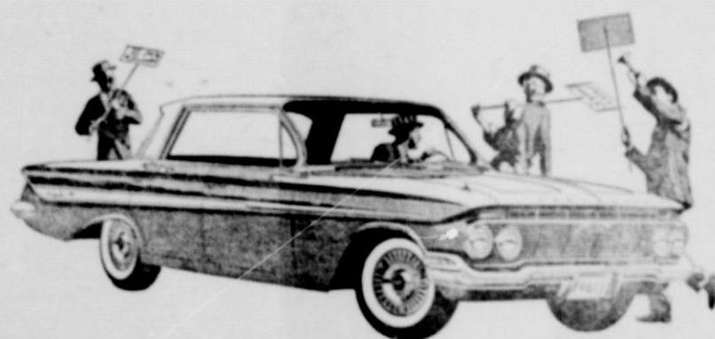
New '61 Chevrolet IMPALA SPORT SEDAN You've got five Impalas to pick from—models that put the accent on luxury while offering all of Chevy's new ideas about comfort and convenience—like larger door openings, higher seats, and a low-loading deep-well trunk.

Here's a better way to choose your new '61 car. Now your Chevrolet dealer offers a range of models to suit almost any taste or need—in a range of prices to suit any budget. It's the greatest show on worth! A full crew of low, low-priced new Chevy Corvairs, including four wonderful new wagons. New Chevy Biscaynes—offering big-car comfort at small-car prices. Beautiful Bel Airs, elegant Impalas, and the incomparable Corvette. Shown below are just 5 of the 30 different models you can pick from. Come on in and make your '61 car-shopping rounds the easy way—all under one roof!