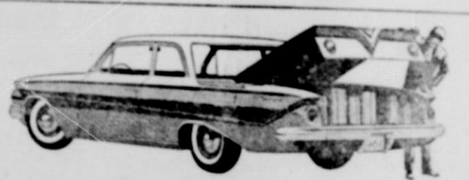
Presenting big-car beauty at small-car prices NEW '61 CHEVY BISCAYNE 6 (2-Door Sedan, above) All Biscaynes, 6 or V8, give you a full measure of Chevy quality, comfort and proved performance. Yet they're priced right down with many smaller cars that give you a lot less!