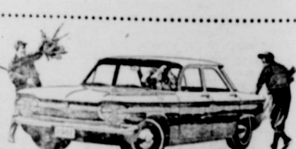
New lower priced '61 CORVAIR 500 4-DOOR SEDAN Like all Corvaire coupes and sedans, this model costs less for '61. You get more spunk, space and savings—and now Corvaire has wagons, too!