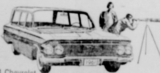
New '61 Chevrolet BROOKWOOD 9-PASSENGER STATION WAGON All six Chevrolet wagons feature a cave-size cargo opening that's nearly five feet across!... plus a new concealed compartment (lock is optional at extra cost) for storing valuables.