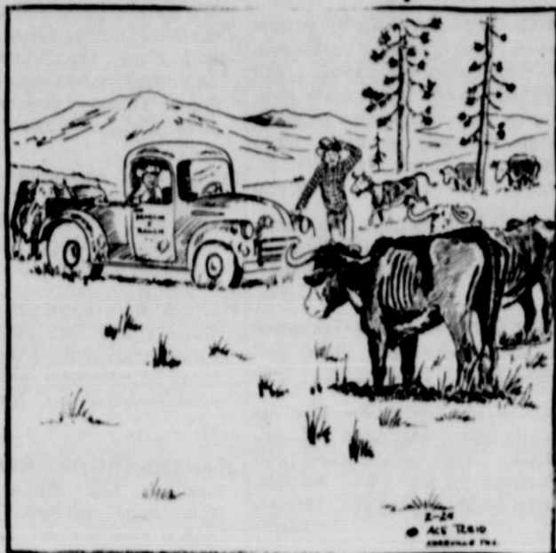
"Gosh, grass everywhere and them Texas cows don't know how to eat it!"

This feature sponsored by THE FIRST STATE BANK