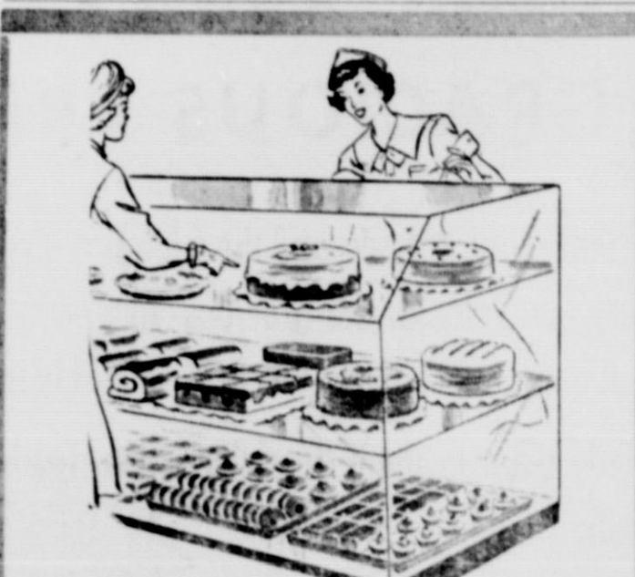
Try Our Delicious Pastry Cakes for all special occasions