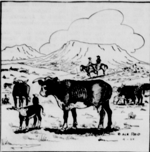
"Yep, the same ol' story... they're born in the spring, mortgaged in the summer and fed in the winter."

This feature sponsored by THE FIRST STATE BANK