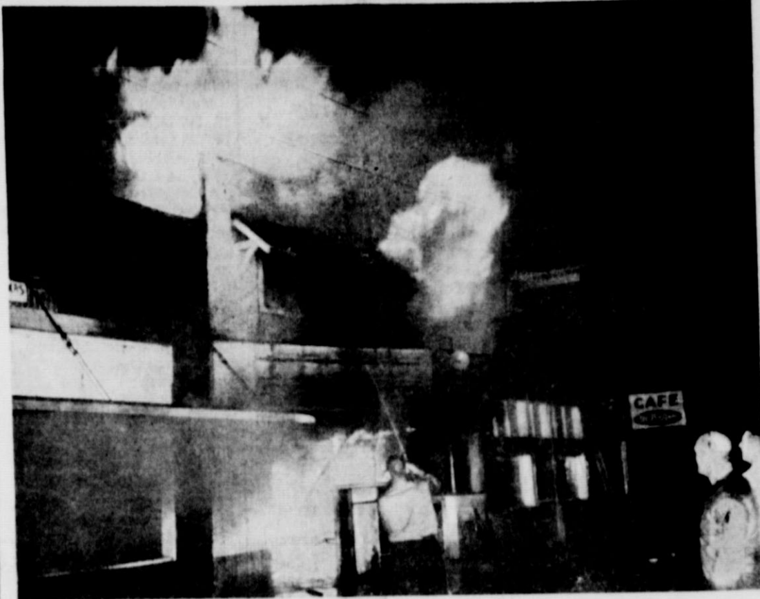
FLAMES EAT through the projection room at the Spring Theatre during the disastrous fire in Roaring Springs Sunday night. Post office at the left was also destroyed. Carl's Barber Shop and Traveler's Hotel at right, were damaged to some extent.