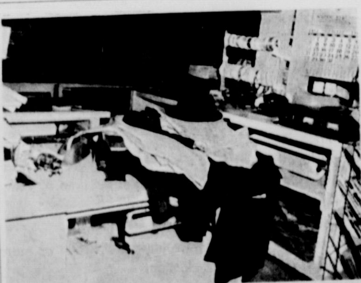
CLOTHING collected in Salem Dry Goods Friday by a burglar who failed to make his get away. He was wearing stylish hat (on top of clothing) when seen inside the store.