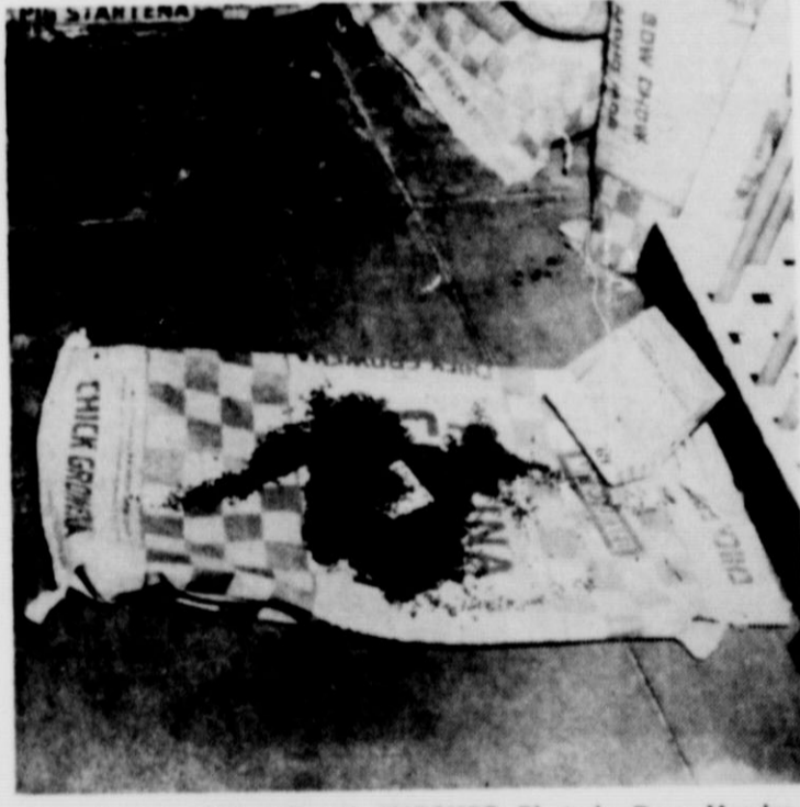
Actual photo of fly kill with CHECKER.

Kill flies... QUICK, EASY! WITH PURINA FLY CHECKER