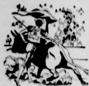
OFFICIAL PUBLICATION MATADOR SCHOOLS