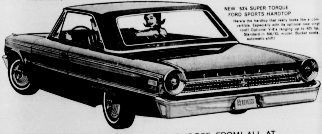
NEW '63 SUPER TORQUE FORD SPORTS HARDTOP Here's the hardtop that really looks like a convertible. Especially with its optional new vinyl roof! Optional V-8's ranging up to 402 hp. Standard in 500/XL model. Bucket seats, automatic shift!

MANY MORE HARDTOPS TO CHOOSE FROM! ALL AT OUR LOW, LOW PRICES AND EASIEST TERMS! GET TOP TRADE-IN PRICE FOR YOUR CAR...IF YOU ACT TODAY!