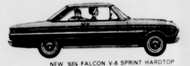
NEW '63 FALCON V-8 SPRINT HARDTOP Topped 'em all in the Monte Carlo Rally! New 164-hp V-8! Bucket seats, eye-level tachometer, center console, "rally" steering wheel, wire wheel covers. All are standard equipment. All wrapped up in smart new "racetrack" roofline.