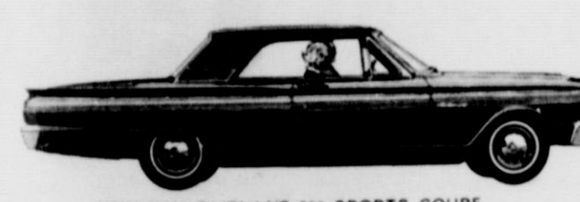
NEW '63 FAIRLANE 500 SPORTS COUPE Topped 'em all in the Monte Carlo Rally! New 164-hp V-8! Bucket seats, eye-level tachometer, center console, "rally" steering wheel, wire wheel covers. All are standard equipment. All wrapped up in smart new "racetrack" roofline.

We Texas Ford Dealers are pricing our hardtops so they are easy for you to own!