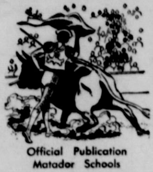
Official Publication Matador Schools