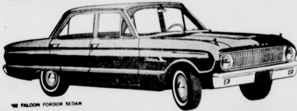
FALCON FORDOR SEDAN

"I CAN LICK YOU AND YOUR KID BROTHER, TOO!"