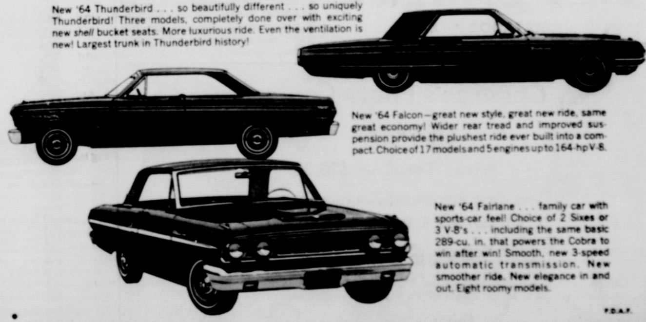
New '64 Thunderbird... so beautifully different... so uniquely Thunderbird! Three models, completely done over with exciting new shell bucket seats. More luxurious ride. Even the ventilation is new! Largest trunk in Thunderbird history!

What's new? This year only your Ford Dealer can say 'Everything!'