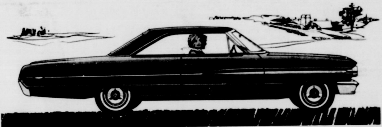
Solid, swift, silent Super Torque Ford for '64! Bred in open competition, built for total performance—hundreds of pounds heavier, it's stronger, smoother, steadier than any other car in its field. Sixteen new body styles, 5 distinct rooflines.

FREE WIRING... to Customers Served by WTU. Ask your appliance dealer or WTU for details.