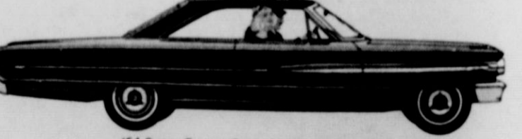
'64 Super Torque Ford—hundreds of pounds heavier, it's smoother, stronger than any in its field!

What's Total Performance? It's the end result of knowledge gained in open competition... a new ride, ruggedness and response bred into every '64 Ford. But words alone can't tell you how much Fords have changed. You have to test-drive the cars themselves. The seat of your pants may not be very scientific...but you'll get the message!