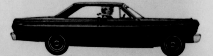
'64 Falcon—the completely new compact!

FORD Matador Auto Company MERCURY Matador, Texas U. S. Highway 70 at Main Street