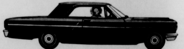
'64 Fairlane—new family car with sports car feel!