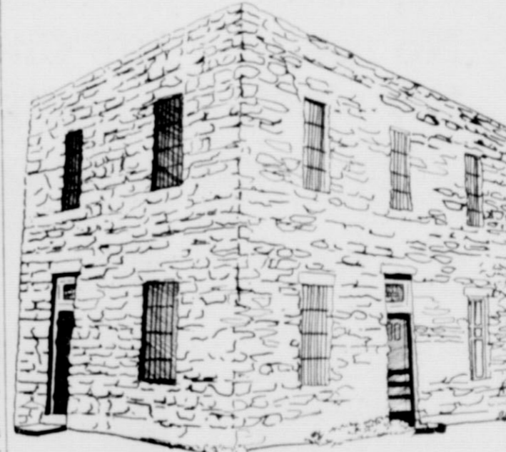
THE MATADOR JAIL