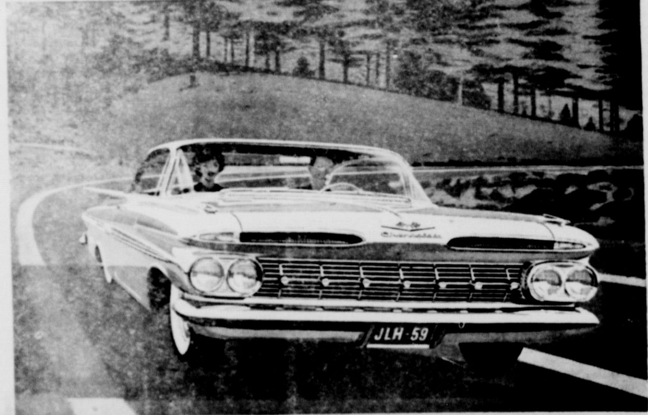
More car than this Impala Sport Coupe is hard to find at any price.

clings to curves like a cat on a carpet! the travel-lovin' Chevrolet