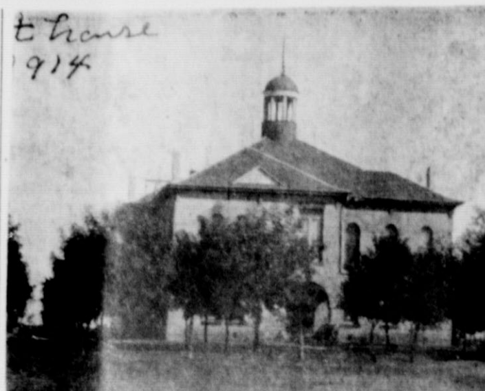
PIONEER PICTURE of old Motley Courthouse made in 1914. This building was destroyed by fire of unknown origin, in September, 1944...