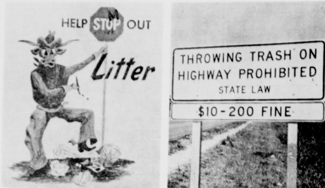
The Texas Highway Department has added two new methods to its continuing anti-litter campaign...