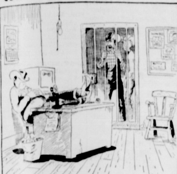
"But Sheriff, it just ain't gonna look right, the big shot of the Cattleman's Association caught stealin' sheep!"

This feature sponsored by THE FIRST STATE BANK