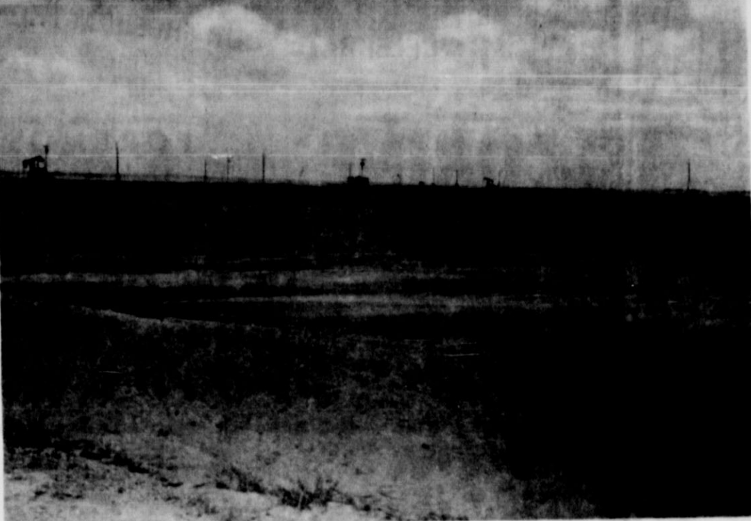
THIS WAS A COTTON FIELD on the Stearns farm east of Roaring Springs, before the Friday, June 13th storm, that damaged or destroyed many thousands of acres of crops across a wide area. Rainfall from four to seven inches was accompanied by devastating hail that destroyed most of the vegetation in its path, and also damaged homes, cars, pickups and other property.