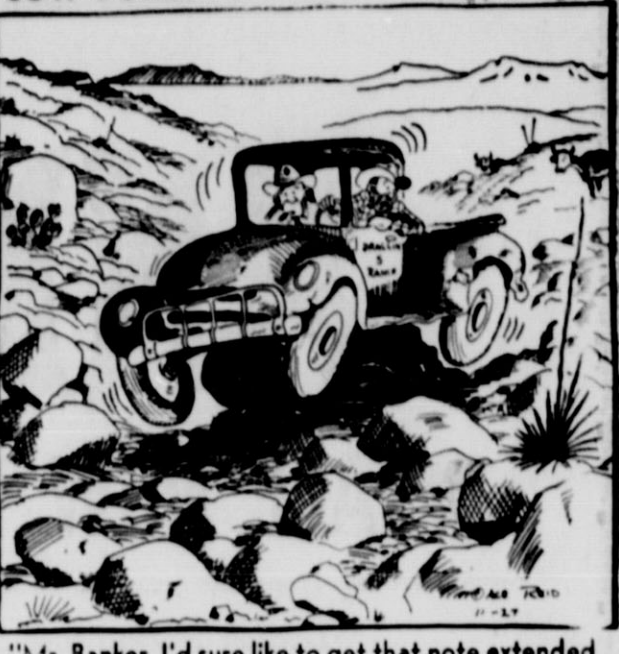
"Mr. Banker, I'd sure like to get that note extended 'fore we start that long walk back!"

This feature sponsored by THE FIRST STATE BANK