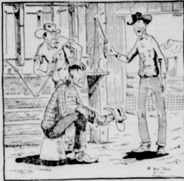
"Wul, now when did we turn the shearin' barn into a beauty parlor?"

This feature sponsored by THE FIRST STATE BANK