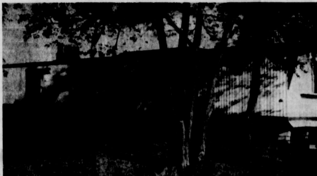
MOBILE HOME where two men died in fire which gutted the home here early Saturday morning. Firemen fought the stubborn blaze for more than an hour before they were able to enter and recover the bodies.

TWO MEN DIED in a fire of unknown origin which destroyed a de luxe mobile home in north Matador early Saturday morning. The fire was discovered about 1 a.m. and the Matador Volunteer Fire Department fought the stubborn blaze for more than an hour.