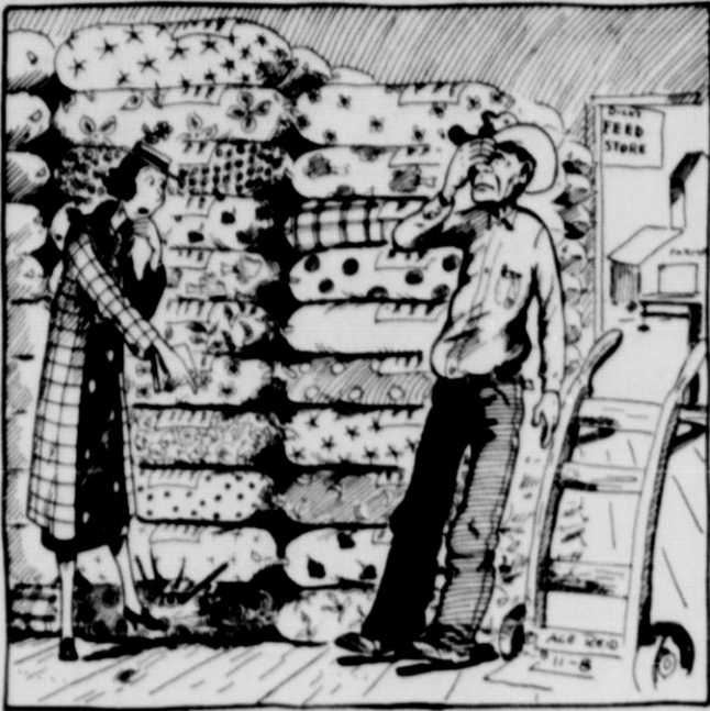
"I'll take this one! It's such a nice print!"

This feature sponsored by THE FIRST STATE BANK