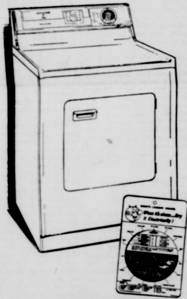
(FREE SPOT AND STAIN REMOVER GUIDE)