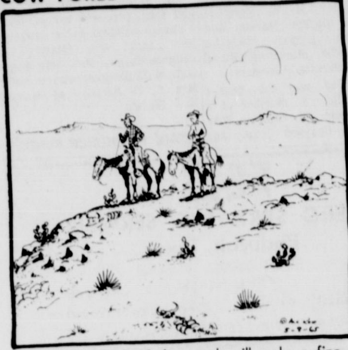
"Now this part of the ranch will make a fine government subsidized recreation area!"

This feature sponsored by THE FIRST STATE BANK