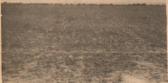
THIS COTTON LAND OWNED BY LEONA COX was interseeded with rye last fall. Interseeded rye not only protects soil from erosion but provides high quality forage for cattle.