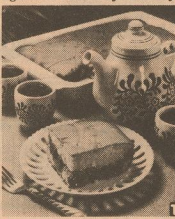
From Peru comes Torta de Pasa, combining walnuts and raisins.

South America: Culinary Ingenuity The food of South America is an eating adventure. In a new, 303-page book, "The International Cook," the cuisines of five Latin countries—Peru, Argentina, Brazil, Colombia and Venezuela—are described in the light of culinary history.