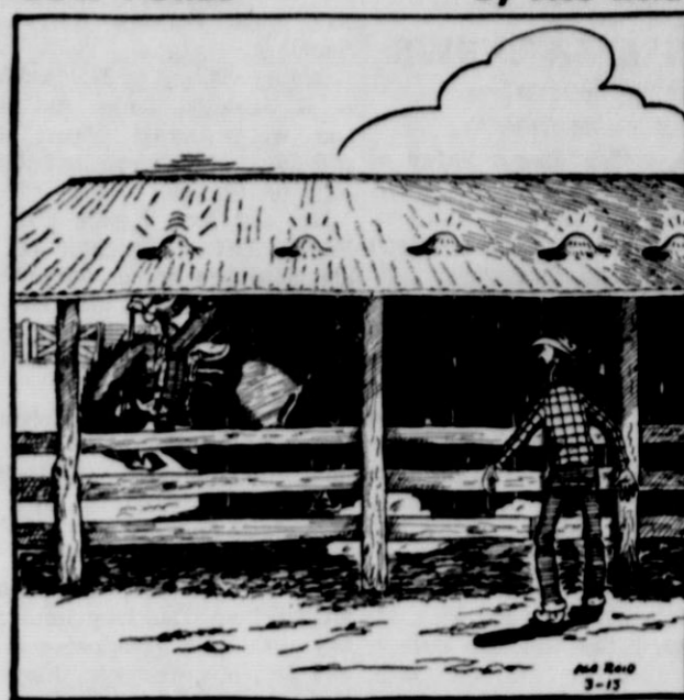
"Wul, I guess that plays whaley with your theory that a hoss wont pitch under a shed."

This feature sponsored by THE FIRST STATE BANK