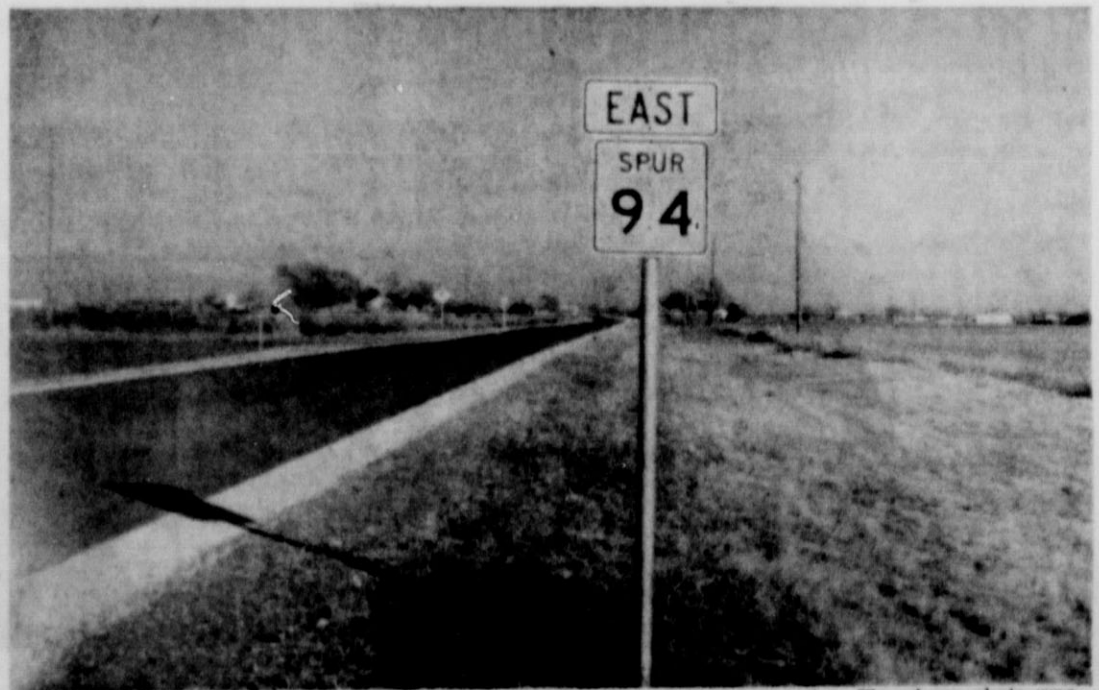
NOT THAT WAY — Spur is not east of Matador, it is south and 40 miles. The above photo was made north of Matador just east of State Highway 70, and is a spur leading to Main Street. The sign should not cause confusion since it is not shaped as those that designate the name and distance to towns.