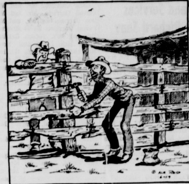
"The boss jist called from Las Vegas and said, "Just repair it, can't afford to replace it."

This feature sponsored by THE FIRST STATE BANK