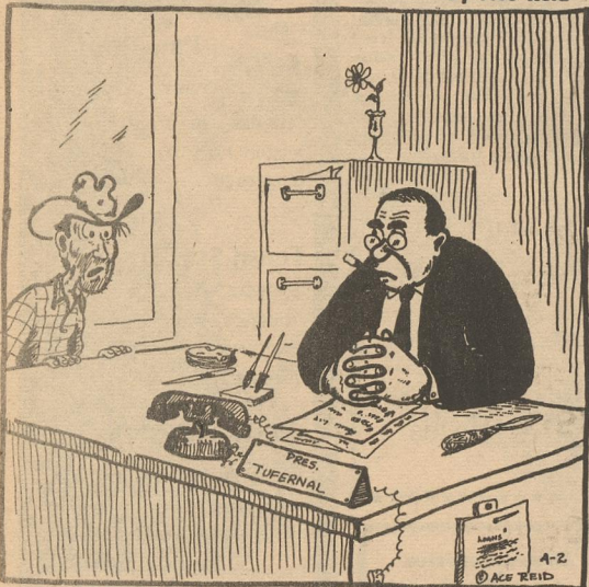
"... and I'll pay you off just as soon as we get a long wet spell and a high cow market!"

This Feature Sponsored By FIRST STATE BANK