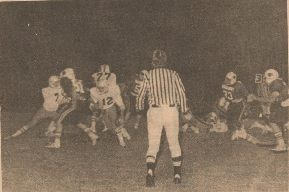
MC defense caused Longhorns problems.