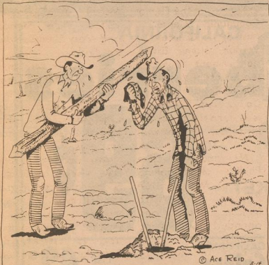
"They got places to stop you from smokin' and drinkin', wish they had one for stoppin' sweatin'!"

This Feature Sponsored By First State Bank