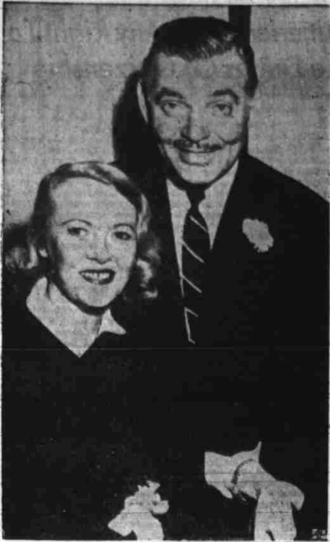
GABLE AND BRIDE—Clark Gable and his bride, the former Lady Sylvia Stanley and widow of the late Douglas Fairbanks, Sr., pose just before their wedding at Solvang, Santa Barbara, Calif. It was the fourth marriage for each.