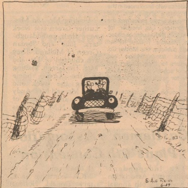
"Out here we can tell which way the winds blowin' jest by the way the posts are leanin'!"

This Feature Sponsored By FIRST STATE BANK